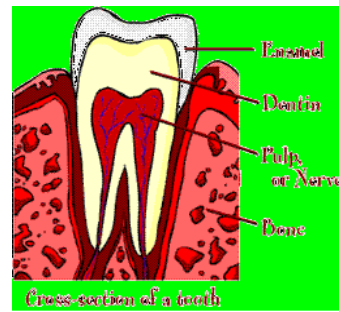
Cross-section of a tooth